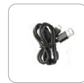
Data cable PC143