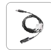
Programming cable PC155